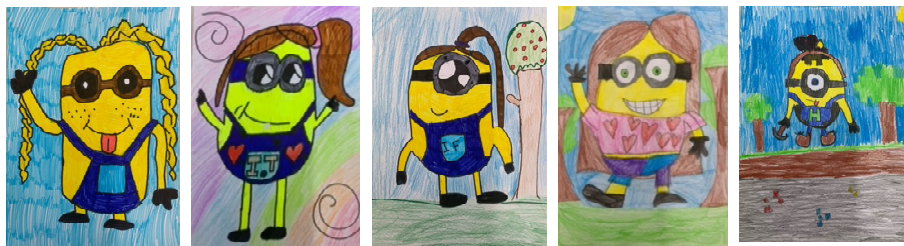
Art by 3/4NS