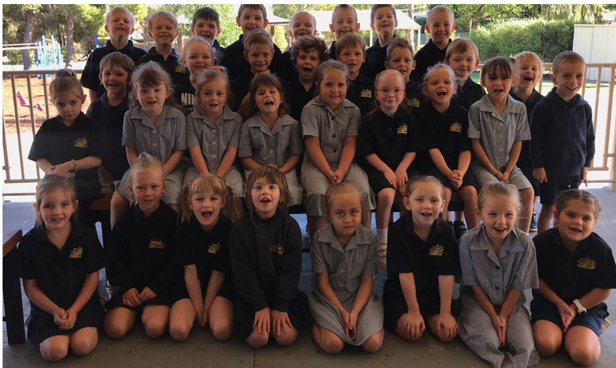
Reception Class of 2021

I would like to welcome our new and returning families and students to Loxton Primary School in 2021. We are excited to see what 2021 holds for us and look forward to a 'new normal' school year, incorporating as many events as possible. 2021 sees us continuing to work to navigate COVID 19 and also sees us in the exciting position of having two year levels head off to high school for the first time. At the conclusion of 2021, our Year 7 and our Year 6 students will leave Primary School for the final time and head off to begin their adventures in High School.